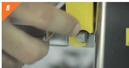
8 Press the lateral button to extract the steel bin. Removable in just one click.