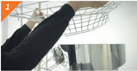
1 Take off the feeder basket.

Caution! For a correct cleaning process please follow the instructions below. Make sure machine is unplugged from electrical current.