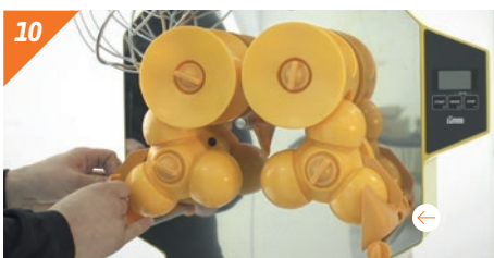
10 Pull off the peel ejectors.