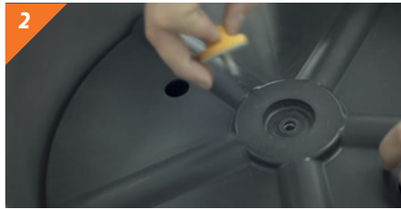
2 Drain&Clean. Drain system that makes easier to clean the feeder.