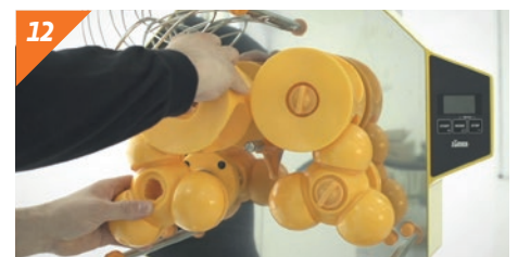
12 Take off the pressing units in pairs.