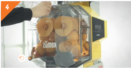
4 Take off front cover. The fixed Click&Clean lugs help clean and handle the machine.