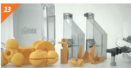
13 Clean parts.