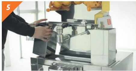
5 Take out the inox peel bucket.