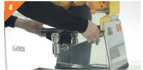
6 Take out the PulpOut system.