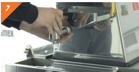
7 Remove the 2Services tap. Easy to dismantle.